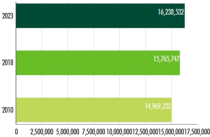
POPULATION BY YEAR